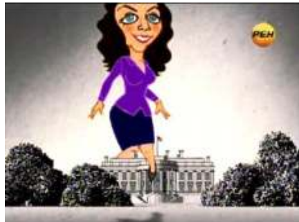
Simonyan steps over the White House in the introduction from her short-lived domestic show on REN TV (REN TV, 26 December 2011)