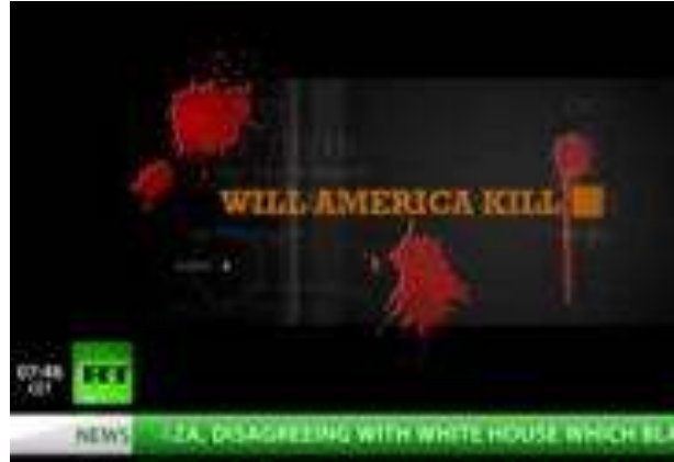
RT new show "Truthseeker" (RT, 11 November)