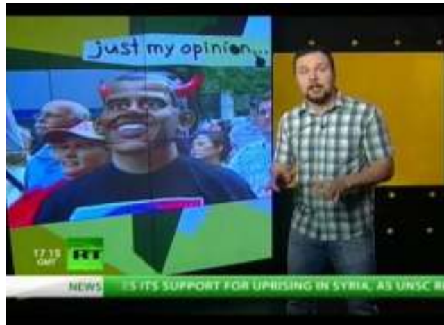
Messaging on RT prior to the US presidential election