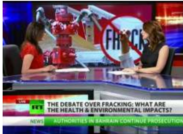
RT anti-fracking reporting (RT, 5 October)