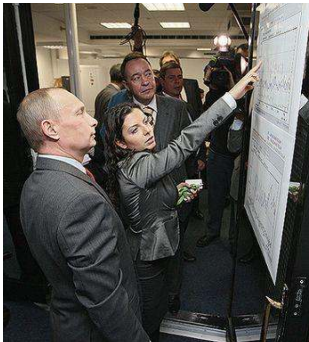
Simonyan shows RT facilities to then Prime Minister Putin. Simonyan was on Putin's 2012 presidential election campaign staff in Moscow (Rospress, 22 September 2010, Ria Novosti, 25 October 2012).